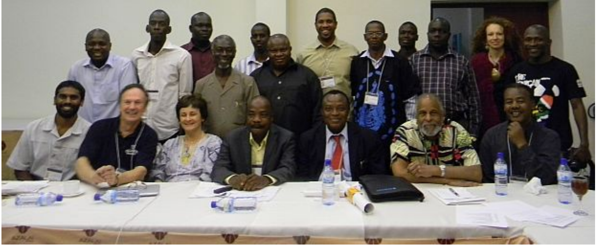
The AfAS Working Group (above) produced the Ouagadougou Declaration, marking the founding of the African Astronomical Society.