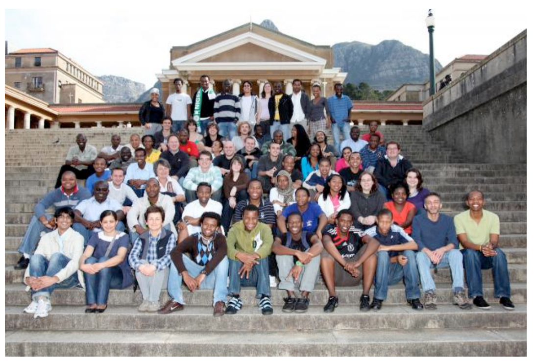
NASSP 2010 group photo of honours, extended honours, and Masters students.