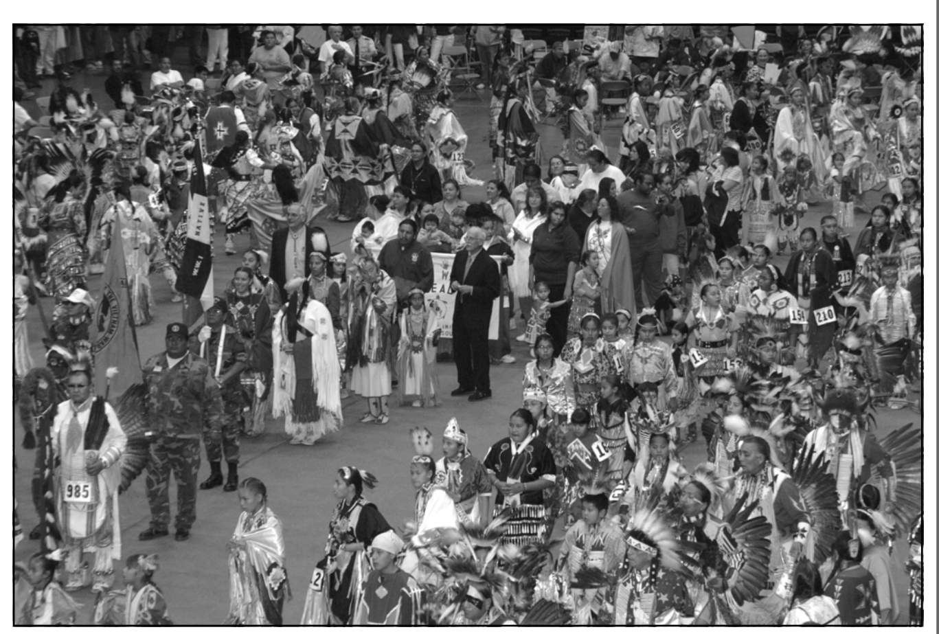
Grand entry processional at the Black Hills powwow.