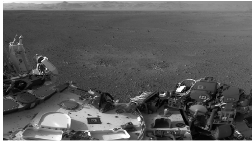
Part of the left side of NASA's Curiosity rover and two blast marks from the descent stage's rocket engines. Rim of Gale Crater in the distance. 10 August 2012

Election Day is on 6 November. Tell your policy makers now what is important to you and to the nation. And tell